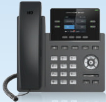
GRP2612(P/W) & GRP2613