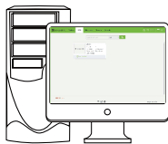
ZK Time Net 3.0